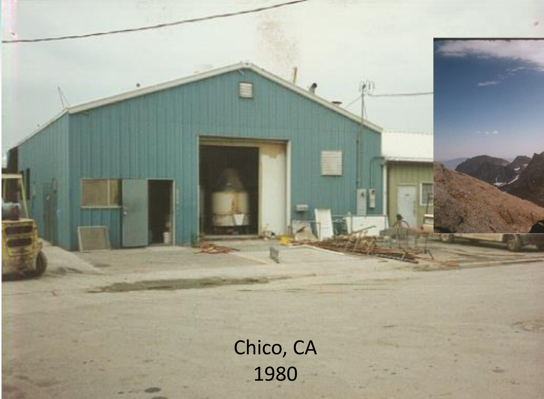
Chico, CA 1980